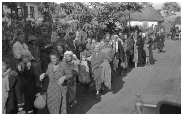
17. Juli 1941

The history of migration during the modern period has been studied without taking into account the respective roles played by men and women in individual and collective displacements. The study of forms of mobility in space, such as leisure travel, exploration, and colonial conquest, has rendered women invisible despite the fact that they were also active figures in long-distance displacements. Female victims of forced displacement have also remained in the dark for a long time. The history of circulations in Europe from the nineteenth century to the early twenty-first century shows how the movements of men and women in space have contributed to the evolution of the gendered division of social roles, as well as the shifting and blurring of gender identities.