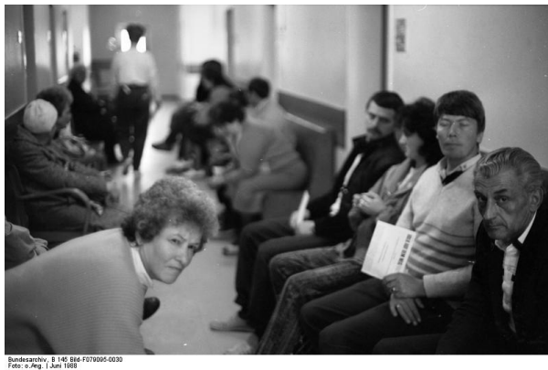
1. Juni 1988