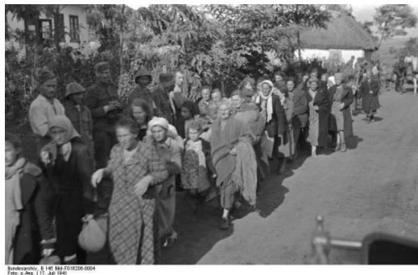
Deportation of Russian Jews: convoys of women and children, July 17, 1941

The history of migration during the modern period has been studied without taking into account the respective roles played by men and women in individual and collective displacements. The study of forms of mobility in space, such as leisure travel, exploration, and colonial conquest, has rendered women invisible despite the fact that they were also active figures in long-distance displacements. Female victims of forced displacement have also remained in the dark for a long time. The history of circulations in Europe from the nineteenth century to the early twenty-first century shows how the movements of men and women in space have contributed to the evolution of the gendered division of social roles, as well as the shifting and blurring of gender identities.