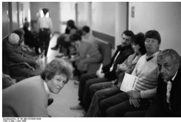
Title in English: Friedland Transit Camp, Aussiedler: men and women waiting in a hallway, June 1988 Original title in German: Lager Friedland, Flur, Aussiedler