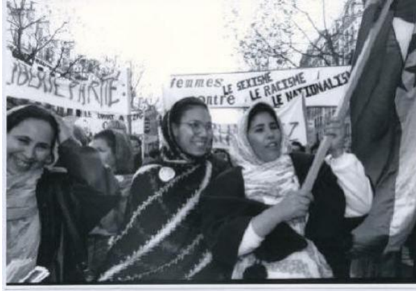
Flüchtlinge June 1988