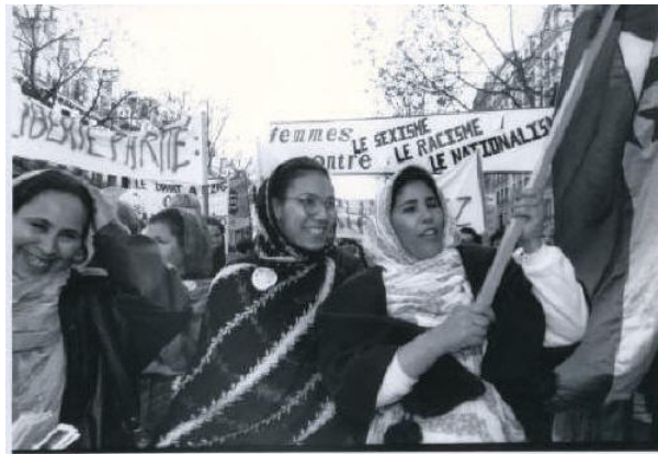
Flüchtlinge June 1988